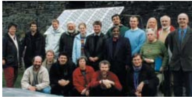
The participants of the INFORSE-Europe NGO Seminar 2003 at CAT, Wales