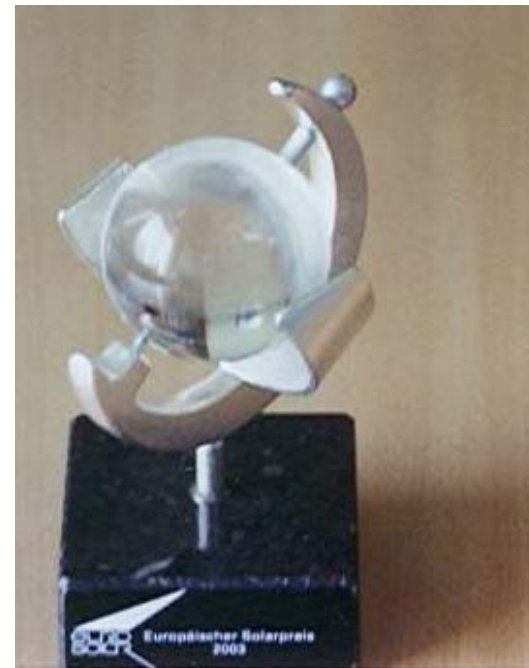
European Solar Prize 2003