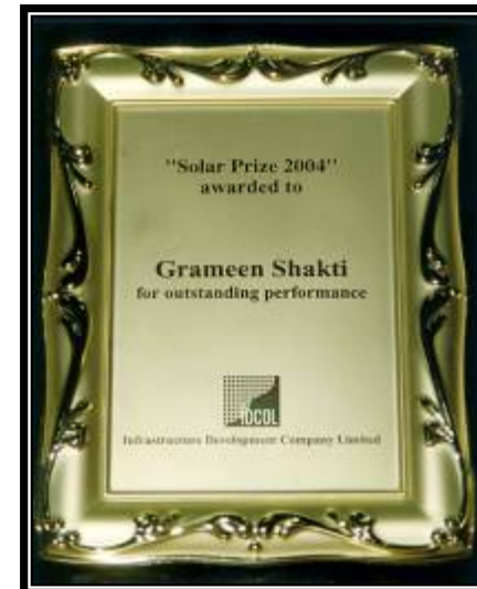
IDCOL Solar Prize 2004