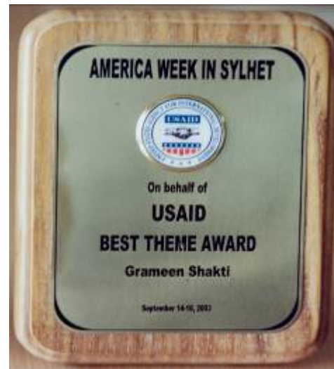
USAID Best Theme Award 2003