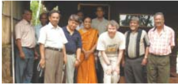
INFORSE-SouthAsia Project partners in Sri Lanka in 2005.

This brochure was published in 2005 in the framework of the INFORSE-South Asian Cooperation project supported by the Danish Small Grant facility for NGOs.