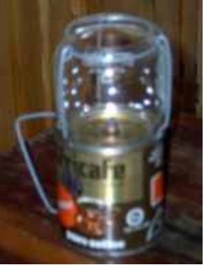
Lamp for Jatropha oil

See more details about the Kakute project: