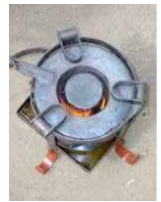
Cooker for Jatropha oil

See more details about the Kakute project: