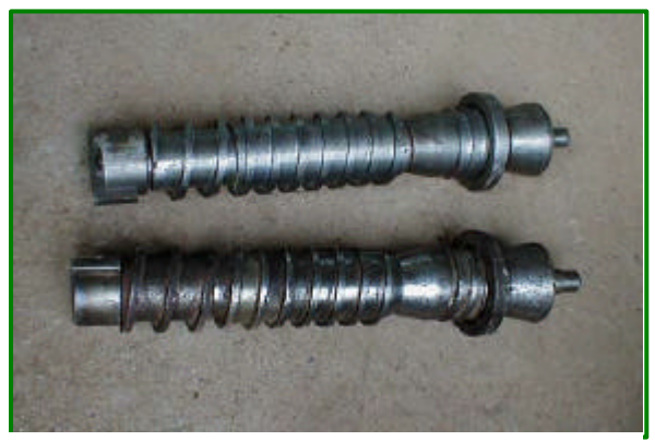
The critical elements: the original Nepali screw (below) and the Malian version (above)

Due to the high pressures involved, a press of this type represents quite a technical challenge. But with effective coordination, original drawings and press made available, a skilled team of engineers and a good workshop, the press was realised.