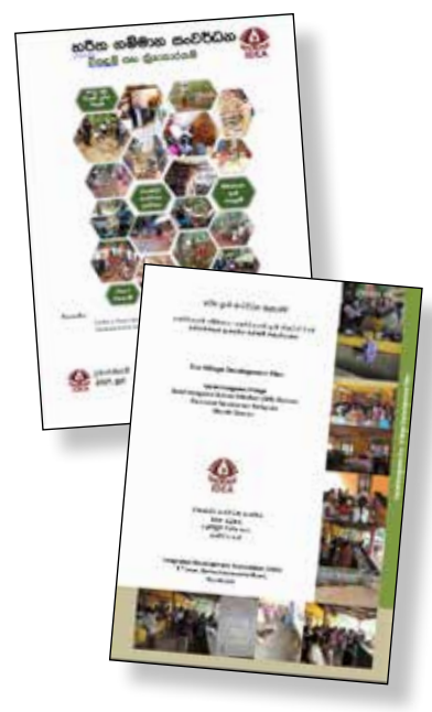
▲ Publications: Collection of EVD case studies and community based Village Development Plans published by IDEA supporting the EVD concept in Sri Lanka.

Sustainable Development Goals (SDGs) and climatechange discussions at the same event are expected to create a healthy basis for ongoing EVD dialogue. SDGs in the context of Sri Lanka, national commitments in terms of Climate Agreements, the "Smart Green Villages" program of the government, and the Sustainable Village Development planning process are to be discussed in the main technical session, prior to the dialogue sessions. Participants will include key stakeholders and decision-makers representing governmental as well as non-governmental sectors.