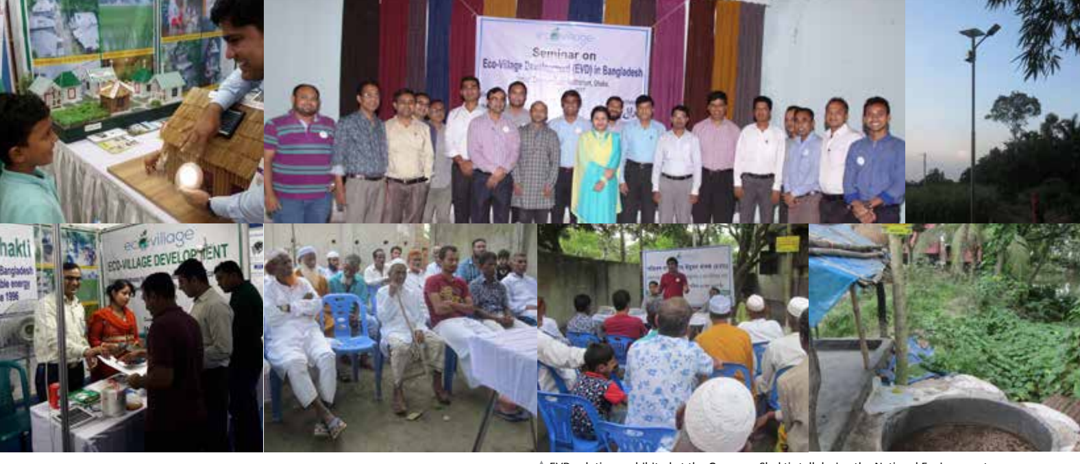
▲ EVD solutions exhibited at the Grameen Shakti stall during the National Environment Fair, national seminar and dialogue, village meetings and demonstration of street light and bamboo slurry pit at a biogas plant.