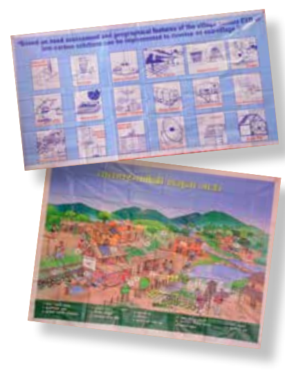
▲ Posters showing the technologies of the eco-village development in Nepal. Published by CRT/N.

On July 7, 2017, some 20 people participated in a field visit and in the subsequent discussion on the EVD concept's possibilities for other villages. The event also marked the launch of the Nepalese version of the 60-page publication of the EVD Concept. Among the participants were a member of the National Planning Commission and the executive director of Alternative Energy Promotion Centre (AEPC), along with the chief and deputy chief of Bethanchok Rural Municipality. Importantly, the national representatives were very positive and assured that they would provide the necessary support, and urged replication of EVD in the entire rural municipality.