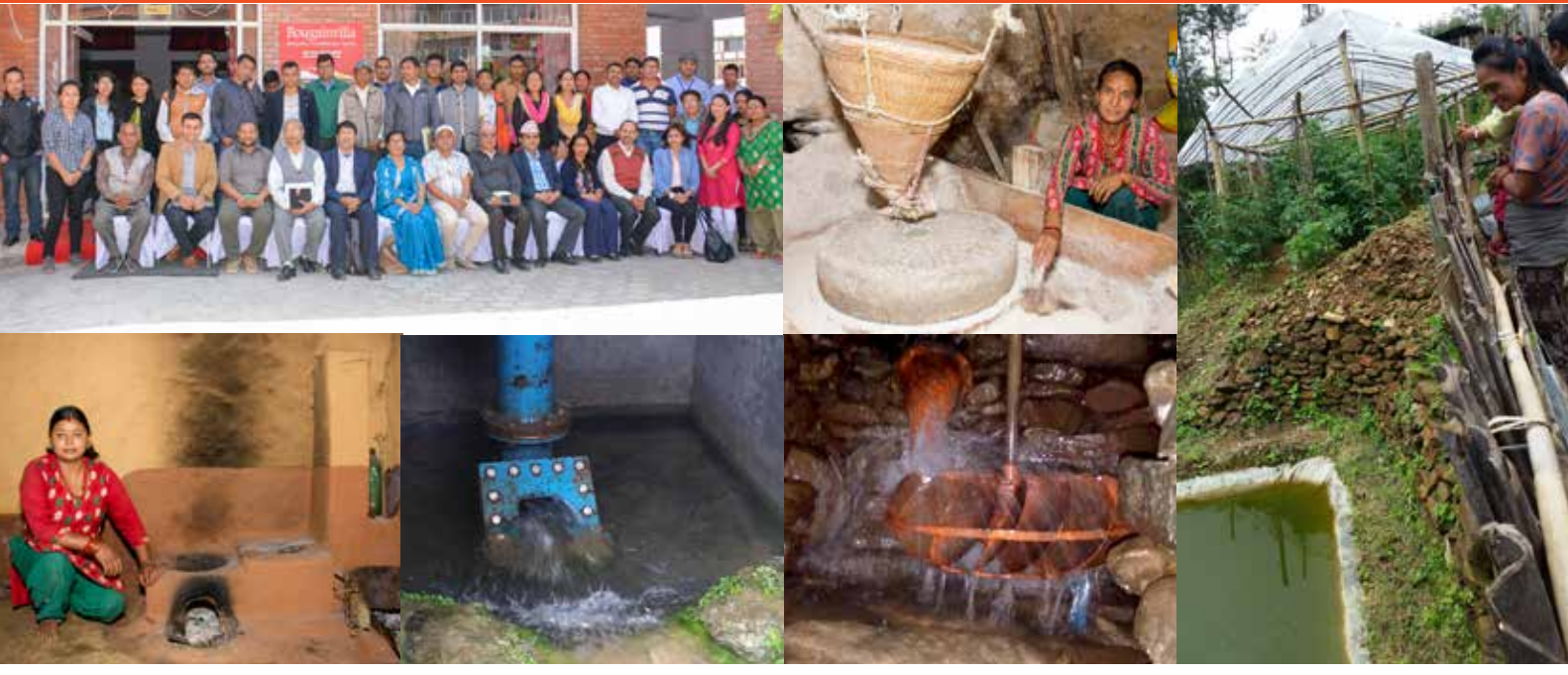
▲ National workshop on EVD and eco-village development solutions: improved cookstove, hydraulic ramp pump, water mill driven grinder, green house and fish farming pond.