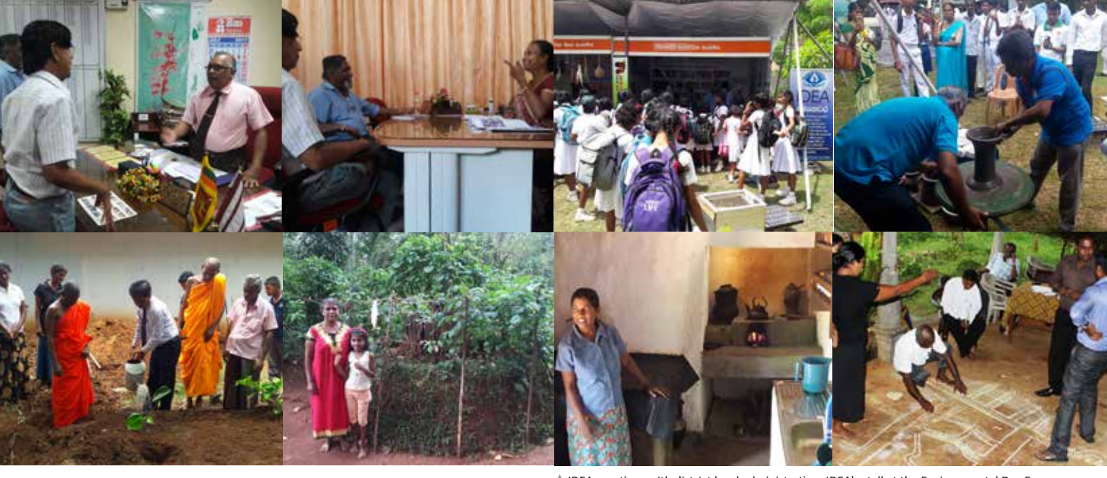
▲ IDEA meetings with district level administration, IDEA's stall at the Environmental Day Exhibition, construction of "Anagi" stove, field visits, compost with growing plants, improved kitchen, and village planning with mapping.