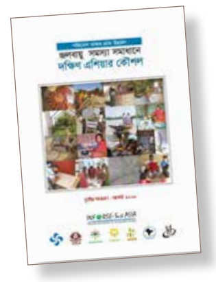
▲ The joint EVD publication "Eco-Village Development as Climate Solution - Proposals from South Asia" in Bangla.