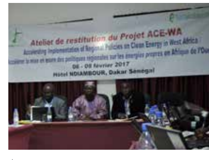
▲ Seminar for accelerating implementation of regional policies for sustainable energies, ACE Project, Dakar, Senegal, 8-9. February 2017.

These activities are supported within the project "Accelerating Implementation of Regional Policies on Clean Energy in West Africa", coordinated by SustainableEnergy, Denmark and with support from CISU. Denmark.